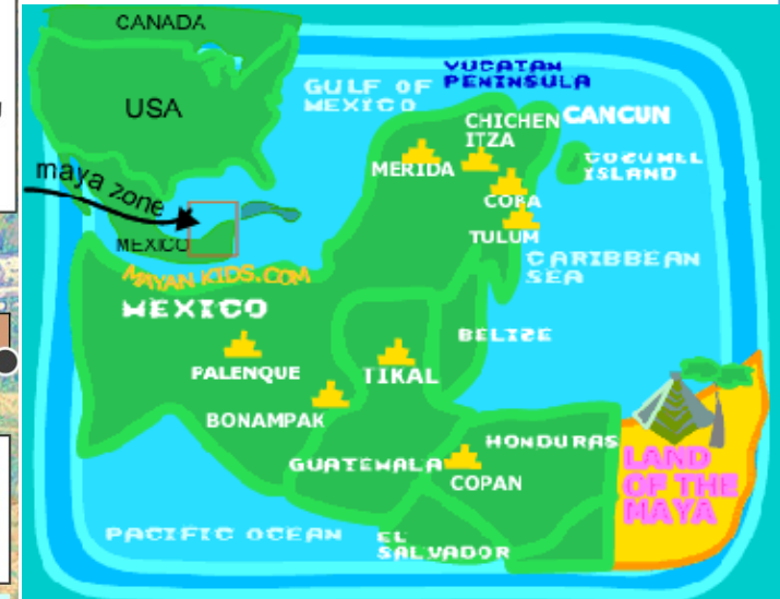
A map of important Mayan sites